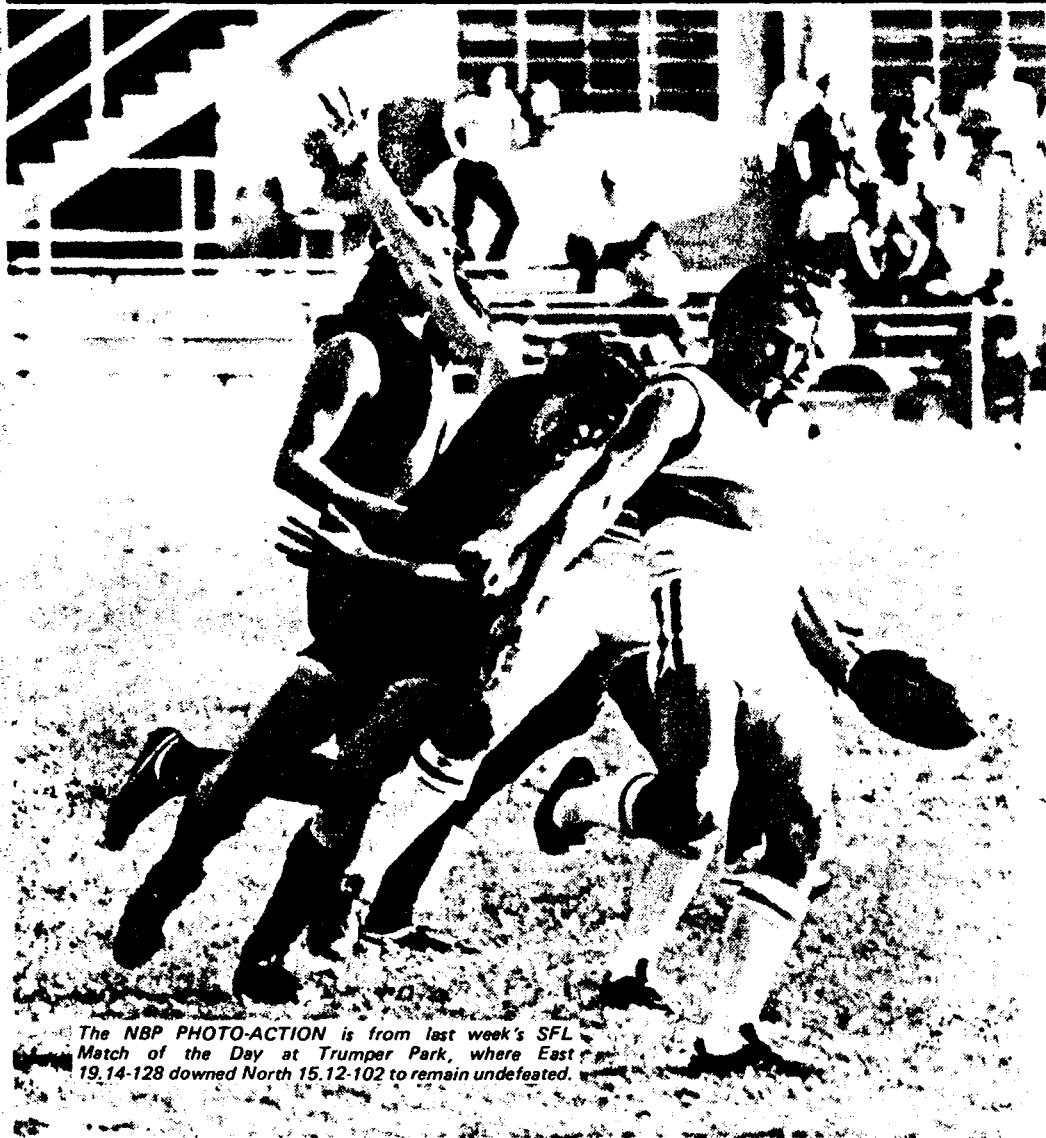
The NBP PHOTO-ACTION is from last week's SFL Match of the Day at Trumper Park, where East 19.14-128 downed North 15.12-102 to remain undefeated.